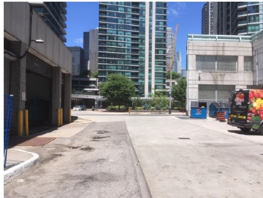
Picture of laneway from Queens Quay side